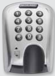
Magnetic Stripe (Insertion) + KEYPAD