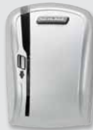
Magnetic Stripe (Swipe)