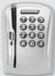
Magnetic Stripe (Swipe) + KEYPAD