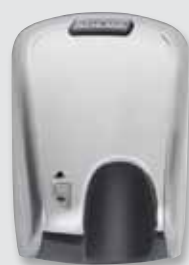
Magnetic Stripe (Insertion)